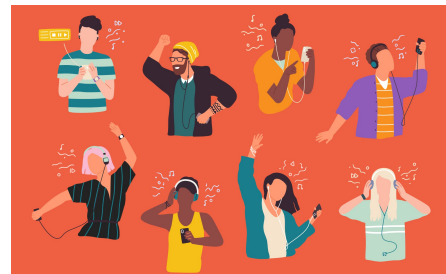
Team Game Night: Name that Tune!