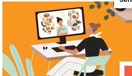
Masterclass: Food for Thought