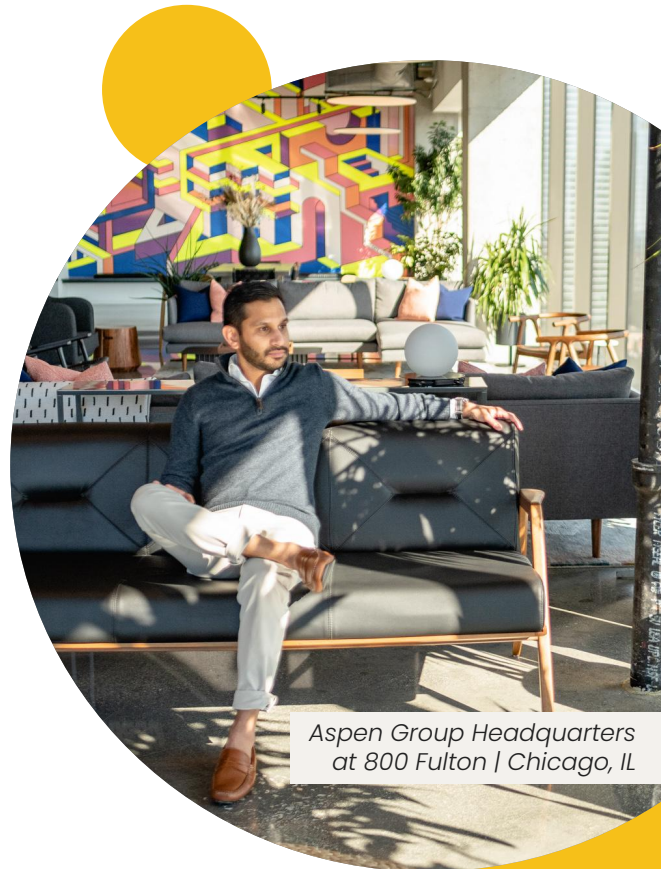
Aspen Group Headquarters at 800 Fulton | Chicago, IL