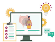
Personalized Health Playbooks