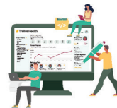
Health & Wellness Tracking