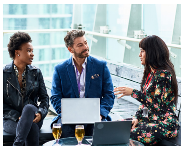
Workplace Harassment Prevention