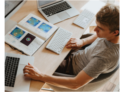
HR Compliance Library