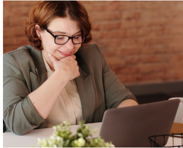
Smart Employee Handbooks