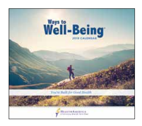
Calendars 365 days of good health.