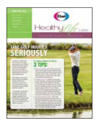
Newsletters Wellness communication on autopilot.